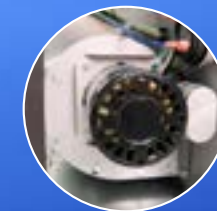
Rotated fan housing for easier reach