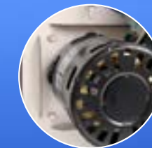
Removable motor mount panel