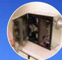
Easier access service panel for gas control valve