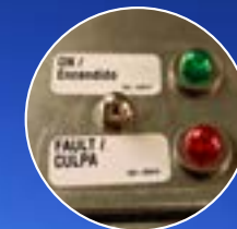
Brighter, easier-to-see indicator lights