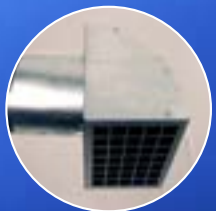
New air outlet duct