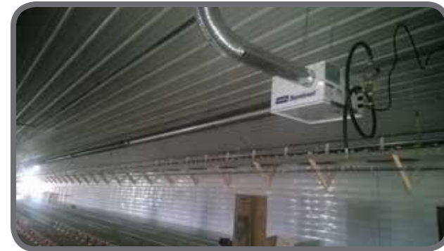
Sentinel, Ceiling Mount